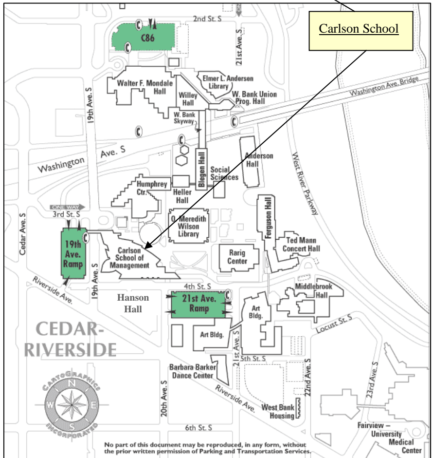
Carlson School of Management and vicinity